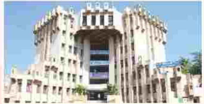
Institute of Management and Rural Development Administration, Sangli