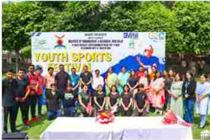
Youth Sports festival- A sports meet organised by Institute