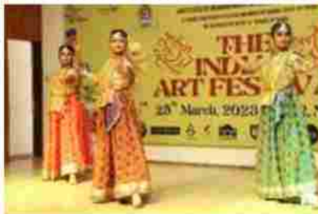
The Indian Art festival – An annual cultural fest