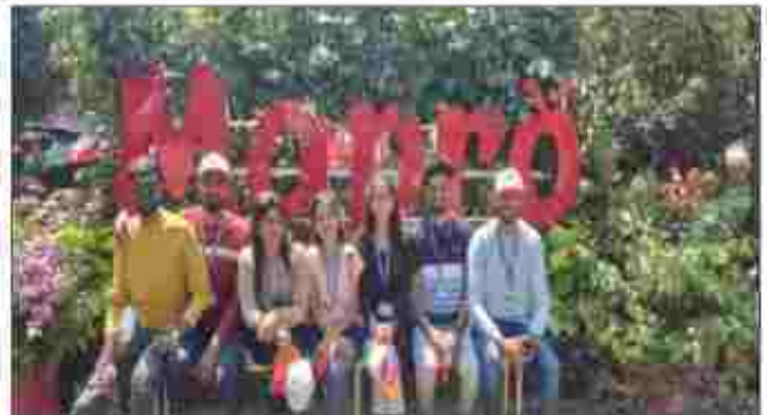
Industrial Visits MBA Sem III visit to MAPRO at WAI Satara District