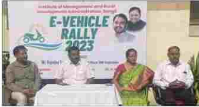
Societal Outreach Programmes Promotion of Clean Environment by using eBikes.