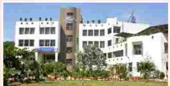
Abhijit Kadam Institute of Management and Social Science, Solapur