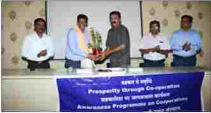
Prosperity through Cooperation: One day Awareness Session on Cooperation