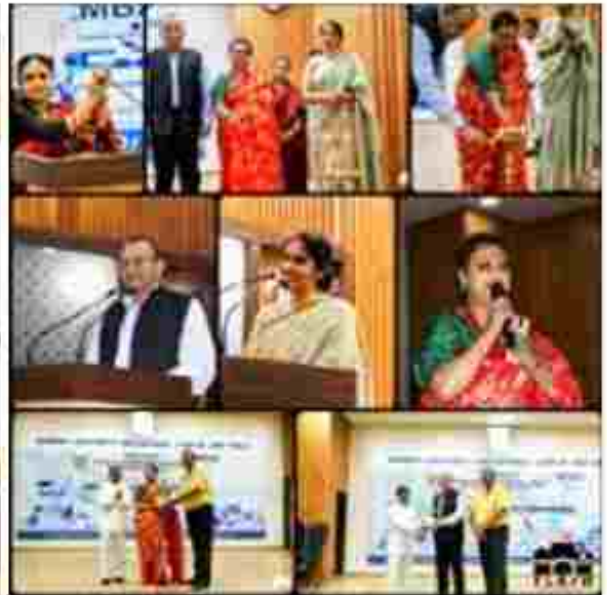
Orientation program for MBA Students