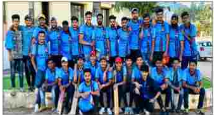
YMIM, Karad Cricket Team