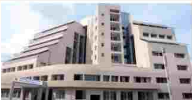
Department of Management Studies, Navi Mumbai