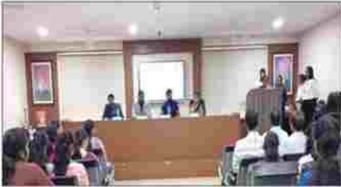
Guest Lecture on - 'Stay Healthy Stay Fit'