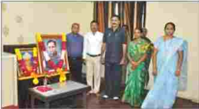
Teacher's Day Celebration