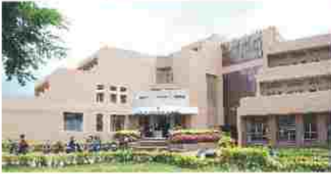
Institute of Management, Kolhapur