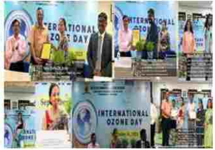
"International Ozone Day" to raise awareness for the preservation of the ozone layer.