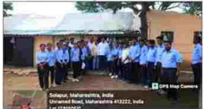
Industrial Visit: visit at Sonaka farm and DKS Poultry farm