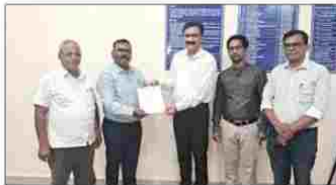
MoU Signed: MoU signed with DAV College, Solapur