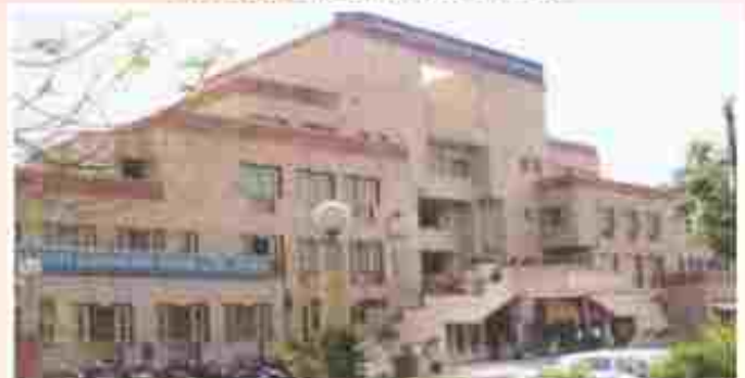
Institute of Management and Research, New Delhi