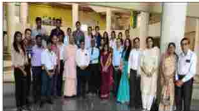
National Youth Day