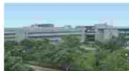
Engineering and Technology