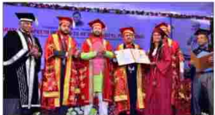
The Best Learning Environment: YMIM KARAD: