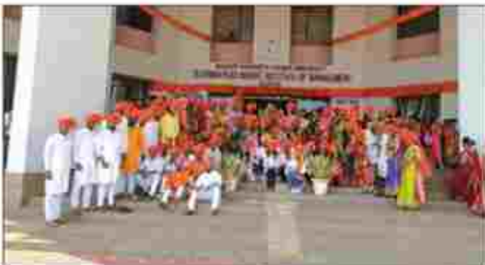
Celebration of Shiv Jayanti