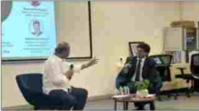
Fireside Chat on Inion Budget