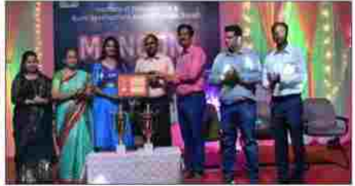
Annual Academic, Cultural and Sports Event- MANCON