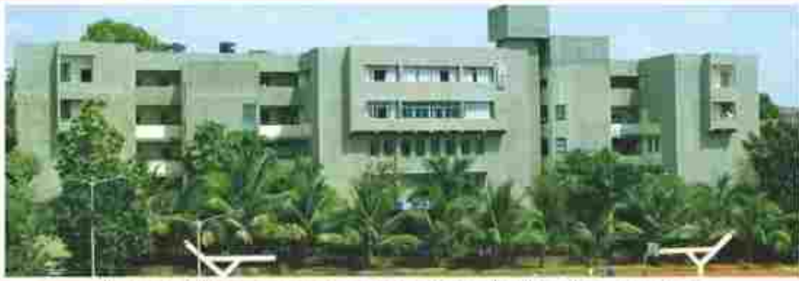
Institute of Management and Entrepreneurship Development, Pune