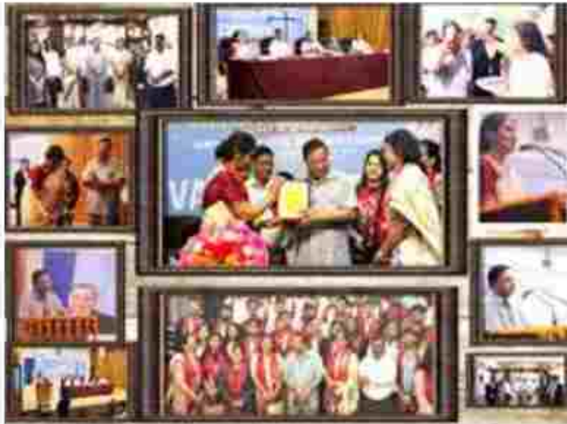
Orientation program for LLB & BALLB students