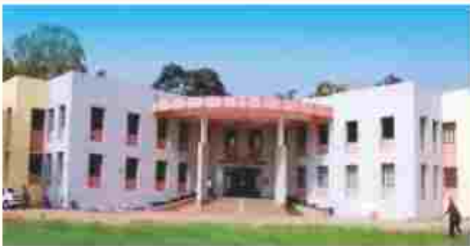
Yashwantrao Mohite Institute of Management, Karad