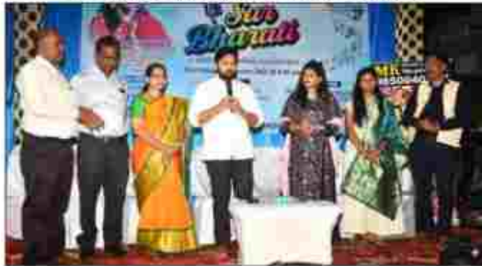
Surbharati- Annual Musical Event