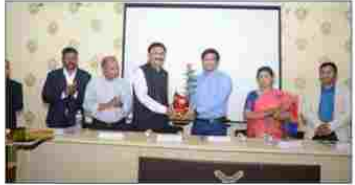
Induction Programme: One Week BBA, BCA Programme Orientation Sessions