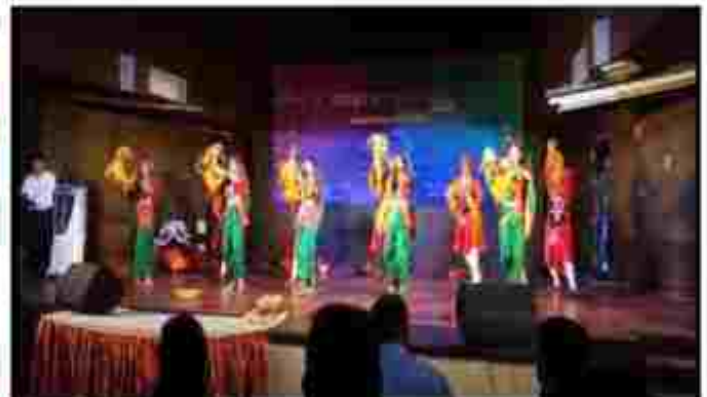
Youth Festival Participation