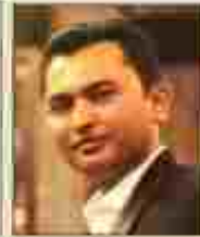
Global Compliance Manager It was a great learning experience at IMED with the heterogeneous environment. The Institute has provided us with the essential corporate managerial skills.

My experience at IMED was extremely wonderful, especially in the marketing area. Practical examples and cases, which were discussed in the class, are helping me a lot in the industry.