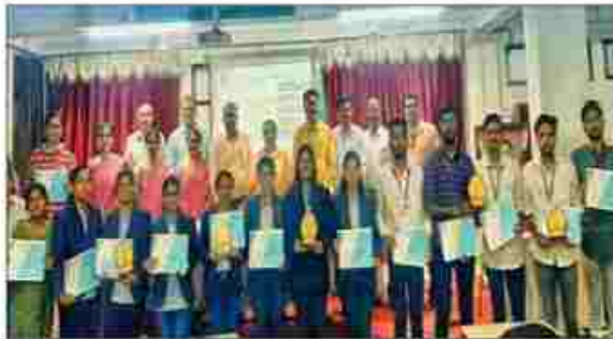
TechnoCraker- Annual Intercollegiate Event