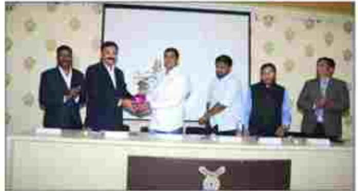
Induction Programme: One Week MBA, BBA Programme Orientation Sessions